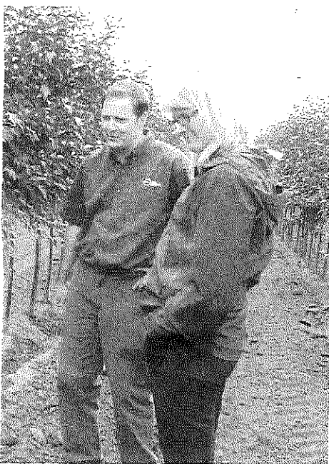
OREGON ENVIRONMENTAL COUNCIL